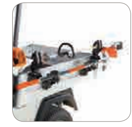
Ratcheting Tool Holder Kit (Upper) & Standard Tool Holder Kit (Lower)