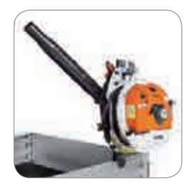
Backpack Blower Rack

More accessories are available. Ask your Club Car sales representative for details.