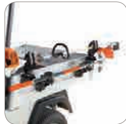
Ratcheting Tool Holder Kit (Upper) & Standard Tool Holder Kit (Lower)