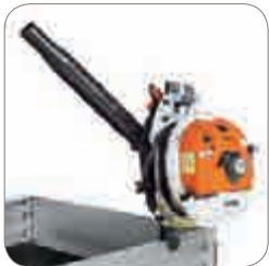
Backpack Blower Rack

More accessories are available. Ask your Club Car sales representative for details.