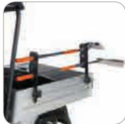
Multi-Tool Holder Kit