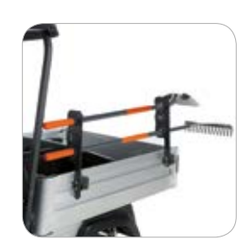
Multi-Tool Holder Kit