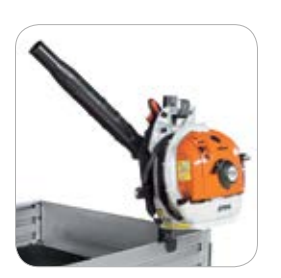
Backpack Blower Rack