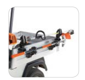
Ratcheting Tool Holder Kit (Upper) & Standard Tool Holder Kit (Lower)