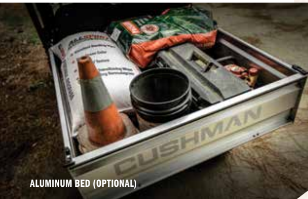
ALUMINUM BED (OPTIONAL)