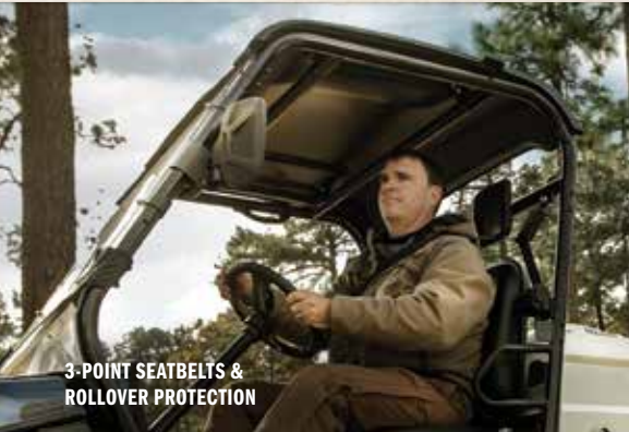
3-POINT SEATBELTS & ROLLOVER PROTECTION